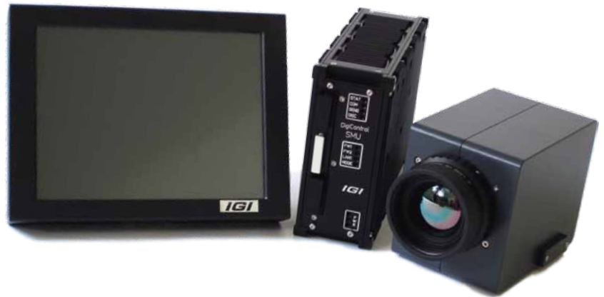
8 inch TFT touch-screen,