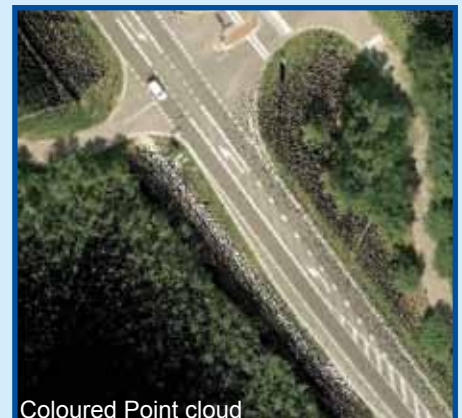
Coloured Point cloud

StreetMapper is the result of a joint venture between guidance and navigation specialist IGI mbH and 3D Laser Mapping Ltd.